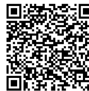
Instructions for installation

Tank installation is fast and simple and can be made in few hours. Excavate the pit, install the tank and fill with the water at the same time. Connect it to the inflow and the outflow pipes (various standard pipes possibility). Tank can be installed by Roto experts. Installation must be made according to general instructions accessed on the QR code.