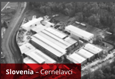
Slovenia – Cernelavci