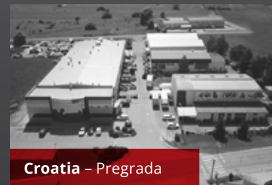
Croatia – Pregrada