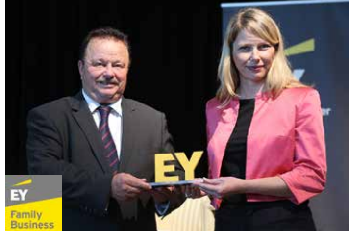
EY Family Business