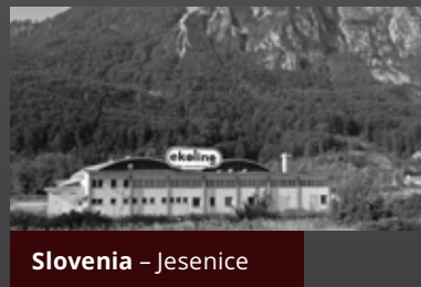
Slovenia – Jesenice