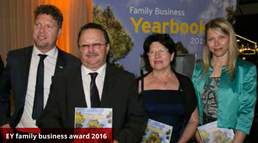
EY family business award 2016