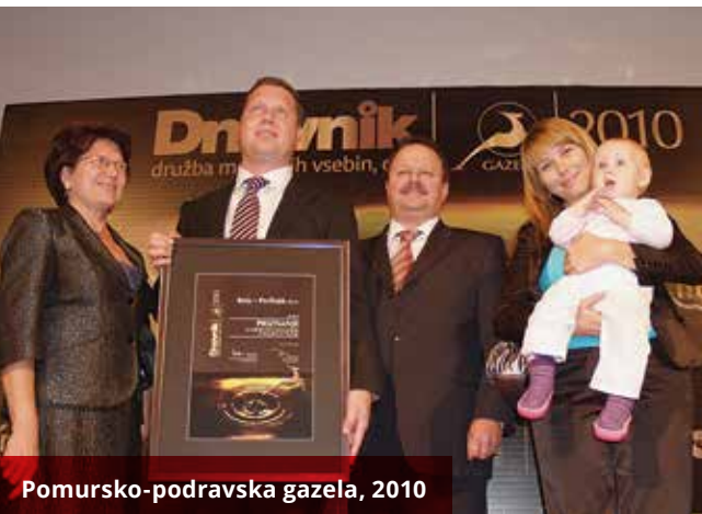
Pomursko-podravka gazela, 2010

The company has received a number of international awards. The company has certified and patented a number of innovative products.