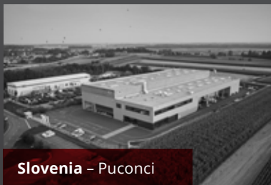
Slovenia – Puconci