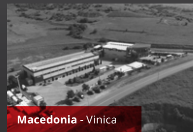
Macedonia – Vinica