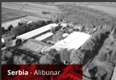
Serbia – Alibunar