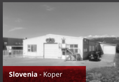
Slovenia – Koper