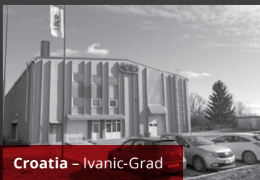
Croatia – Ivanic-Grad